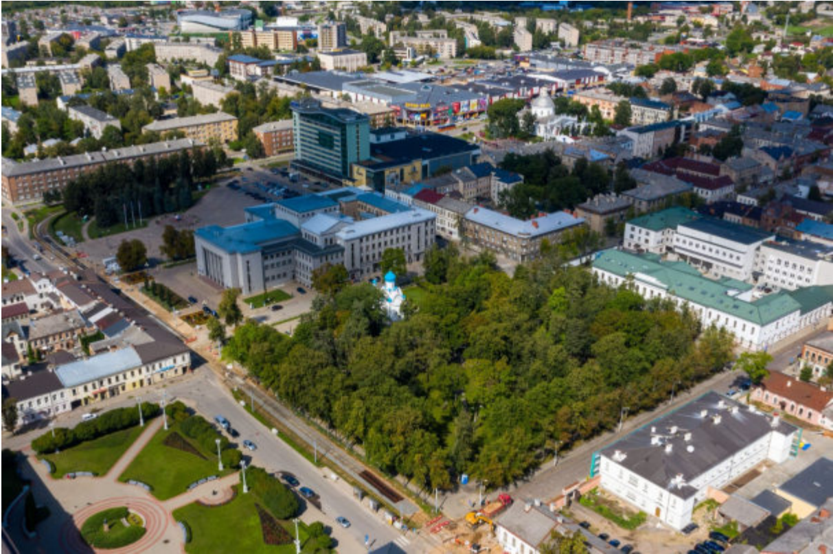
View of the historical centre of Daugavpils