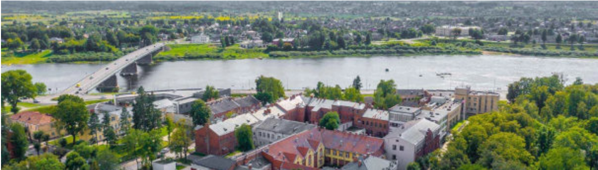
View of the Daugava River